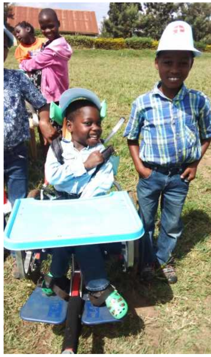
Children with Cerebral palsy having fun on the CP day cerebration in a Picture at Bukerere playground 2019